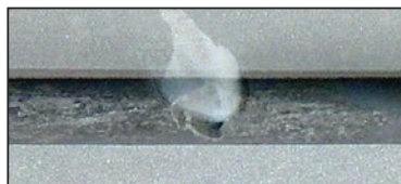
PROBLEM: Damaged A/C aluminum line