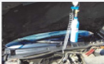
Easily connects to vacuum line